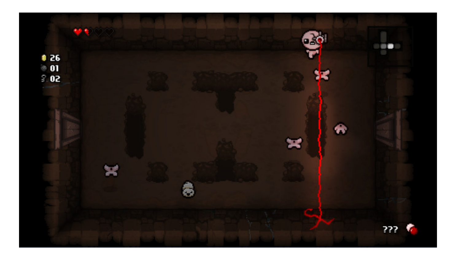
The Binding Of Isaac: Rebirth Download Setup Compressed